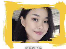
GIOK NA @li.na.ta

Artworks inspired by rerajahan (sacred Balinese sorcery), incorporated with current social issues.